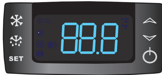
Figure 1. Digital Temperature Controller

Perlick Signature Series and Signature Sottile units come standard with state-of-the-art digital control. The following information is instructions on how to use the controller.